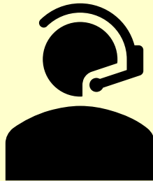
Photo Description (ALT Text) A silhouette of a person wearing headphones with microphone